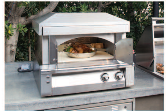
Countertop Pizza Oven Plus