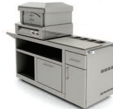
Pizza Prep Cart