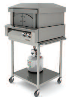
Pizza Basic Cart